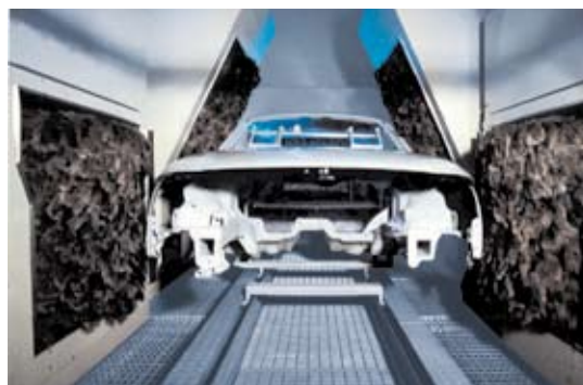
Car body cleaning with the slanted roller and with the vertical roller

From back to front: roof roller, slanted roller, vertical roller, post-ionisation