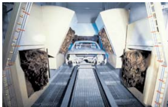
Ecopaint Clean F5 in production operation

From back to front: roof roller, slanted roller, vertical roller, post-ionisation