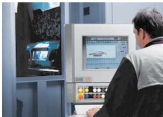
Installation visualisation system and operator terminal